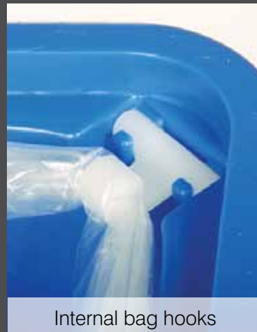
Internal bag hooks