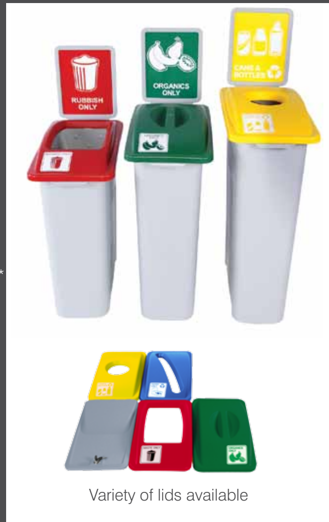
Variety of lids available

SULO MGB Australia 123 Wisemans Ferry Road Somersby NSW 2250 Australia T: (02) 4348 8188 F: (02) 4348 8128