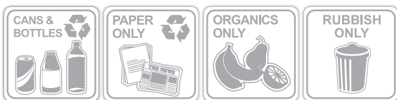
Individual waste stream stickers included with lids