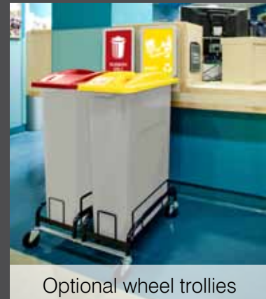
Optional wheel trolleys