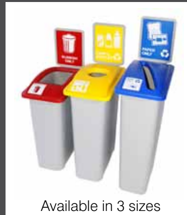
Available in 3 sizes