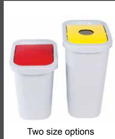
Two size options